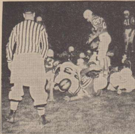
Extra point at Paso game places Tigers in CIF playoffs. Tigers to play Camarillo during Thanksgiving holiday. Exact date uncertain at press time.

858 Higuera Street, San Luis Obispo Phone LI 3-8424