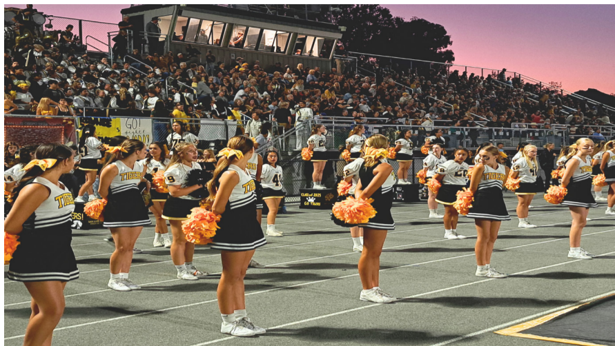
The wonderful SLOHS cheerleaders cheered at every home football game this season!