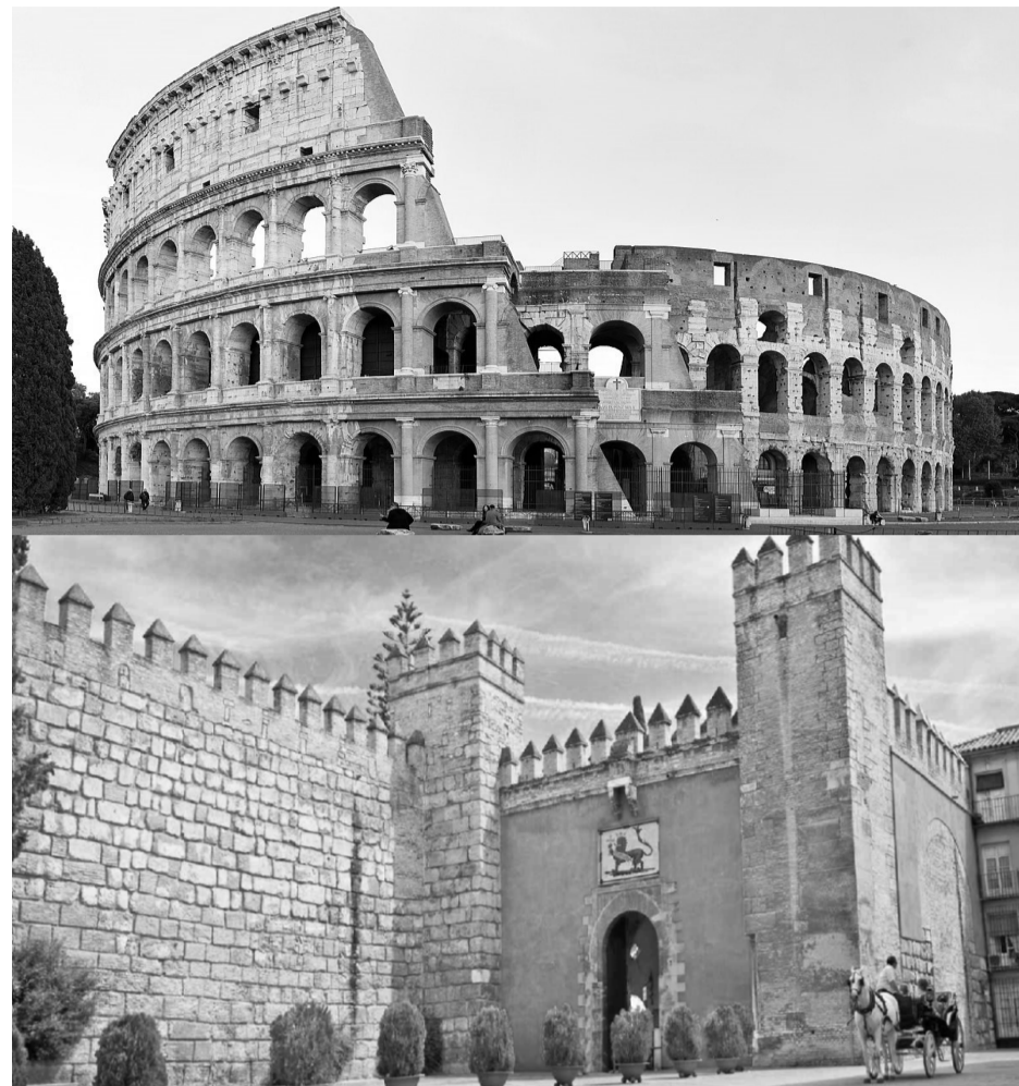
Common symbols of the Roman Empire and Spain are the Roman colosseum and Spanish castles.