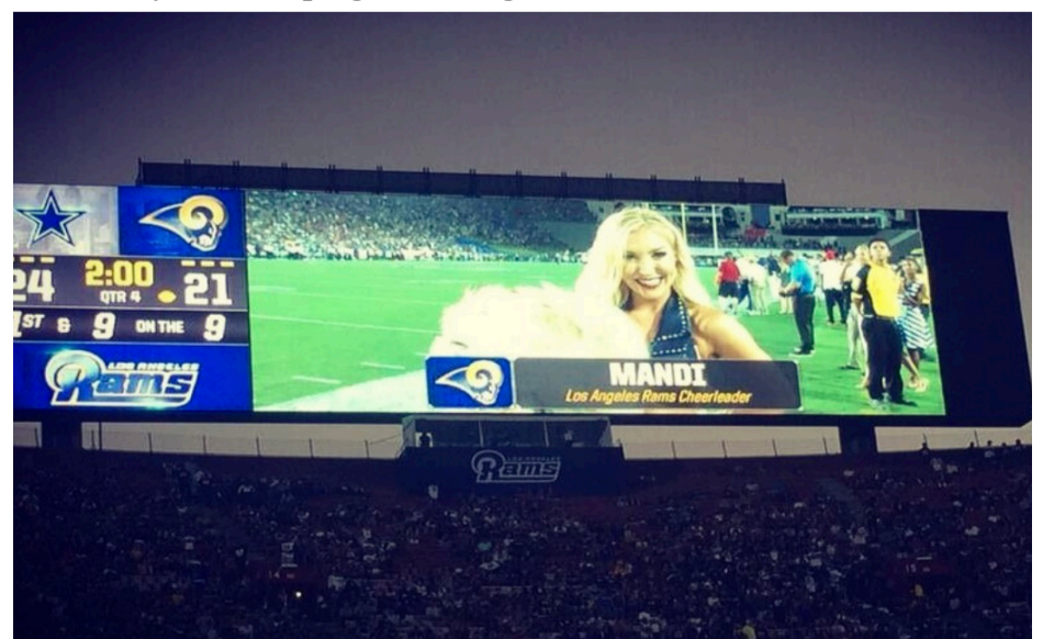
From jumbotron to SLOHS.

Mettler hopes to create a program at SLOHS that builds a supportive community while helping students grow.