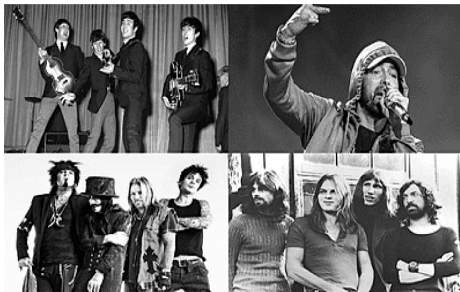
From left to right, the Beatles, Eminem, Motley Crue, and Pink Floyd have been some of the most popular artists in pop, rap, metal, and rock respectively.